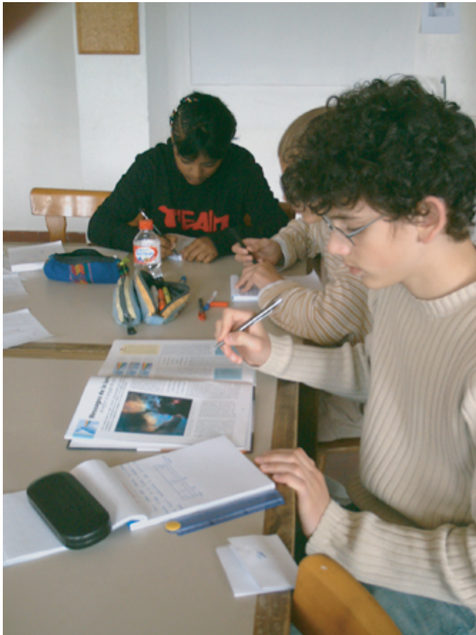
Work on quantic physics