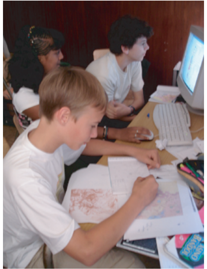
Work on Mars topographic maps and satellite images