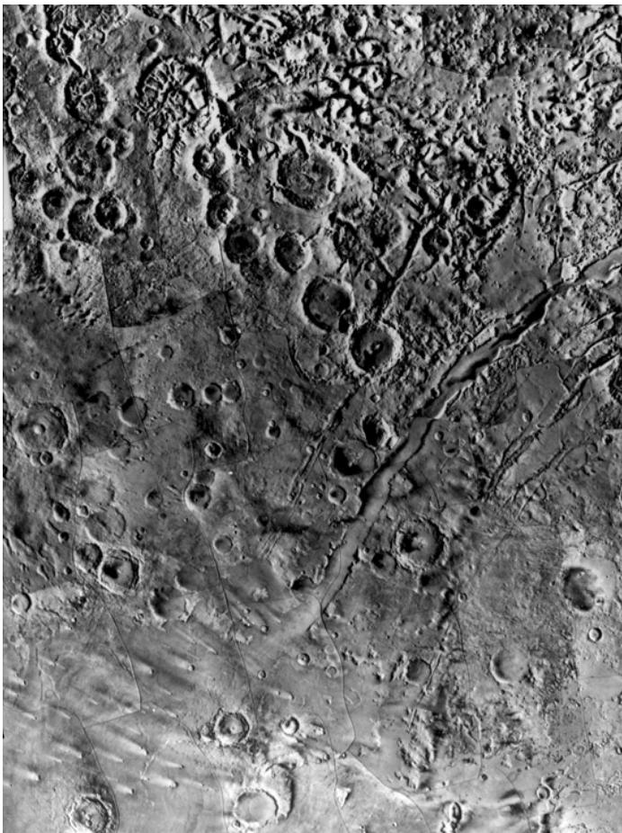
Satellite image of the area